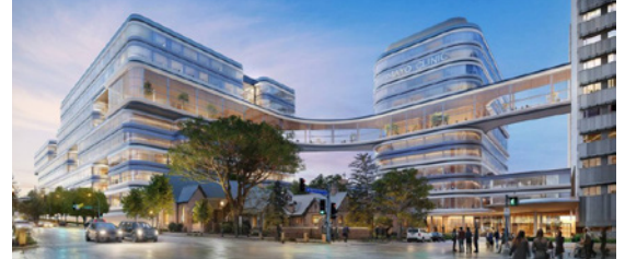
Mayo Clinic’s $5 billion expansion will transform the Rochester Mayo Clinic campus.

creation of “neighborhoods” that allow patients to access continuous care without having to ping-pong around the campus between buildings. Union contractors have been in negotiations for this substantial project development.