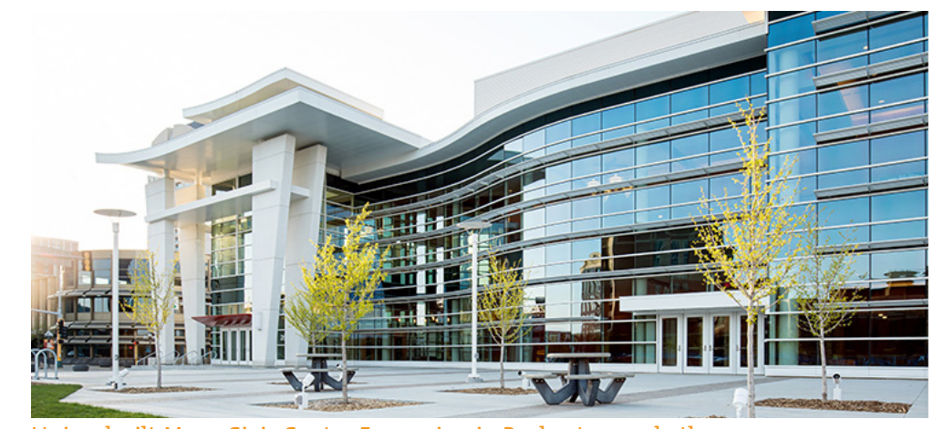
Union-built Mayo Civic Center Expansion in Rochester made the 2017 Finance & Commerce TOP PROJECTS list.