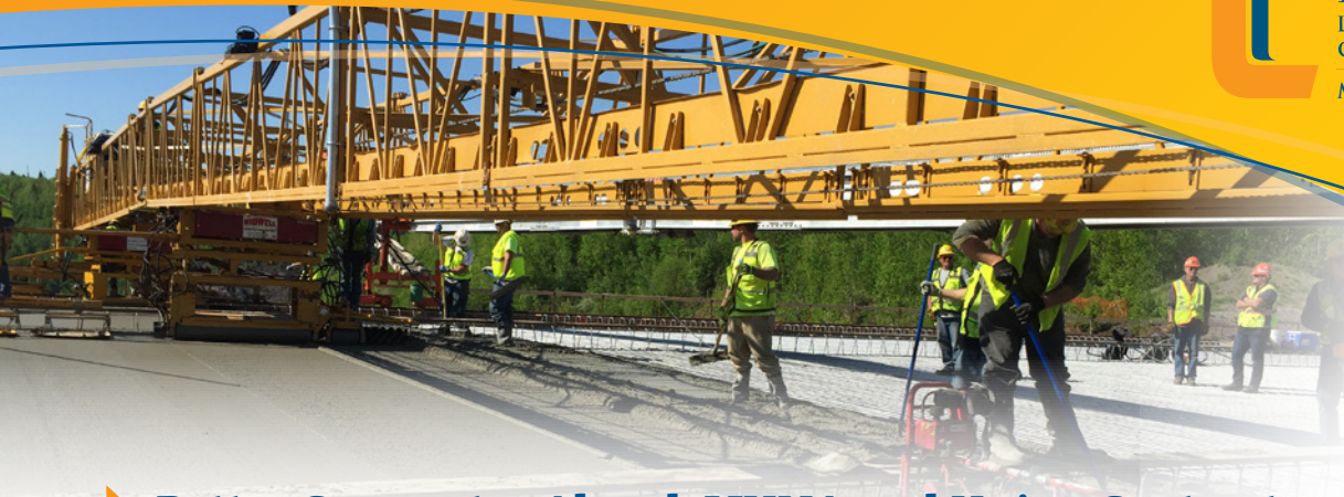
Skilled Laborers and trades on a deck pour at the Hwy 53 Bridge project in Virginia, MN.