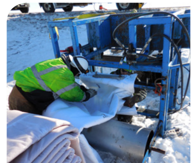
Remote Camera, Pipe Renovation