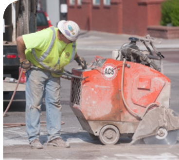
Concrete Cutting & Practices